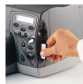
via CompactFlash™ card

Windows is a U.S. trademark of Microsoft Corp. All other brand and product names are trademarks or registered trademarks of their respective companies.